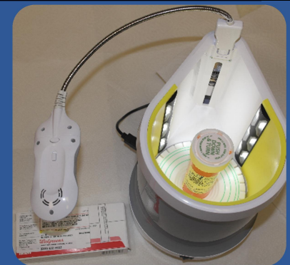
RxLabelReader scanning prescription labels with auxiliary camera.